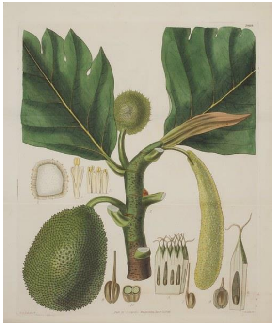
Breadfruit Scientific Drawing. (c. 1800s)

Late Work: Stuff happens. Sometimes life takes priority over schoolwork. If something comes up and you need to miss a class or cannot turn in an assignment let me know immediately. I do not always grant extensions on assignments, but I do try to be flexible. It is imperative, therefore, that when incidents arise you do your diligent best to keep me informed. I cannot, in fairness to the class, accommodate a student for missed work and/or absences when I am notified toward the end of the semester.