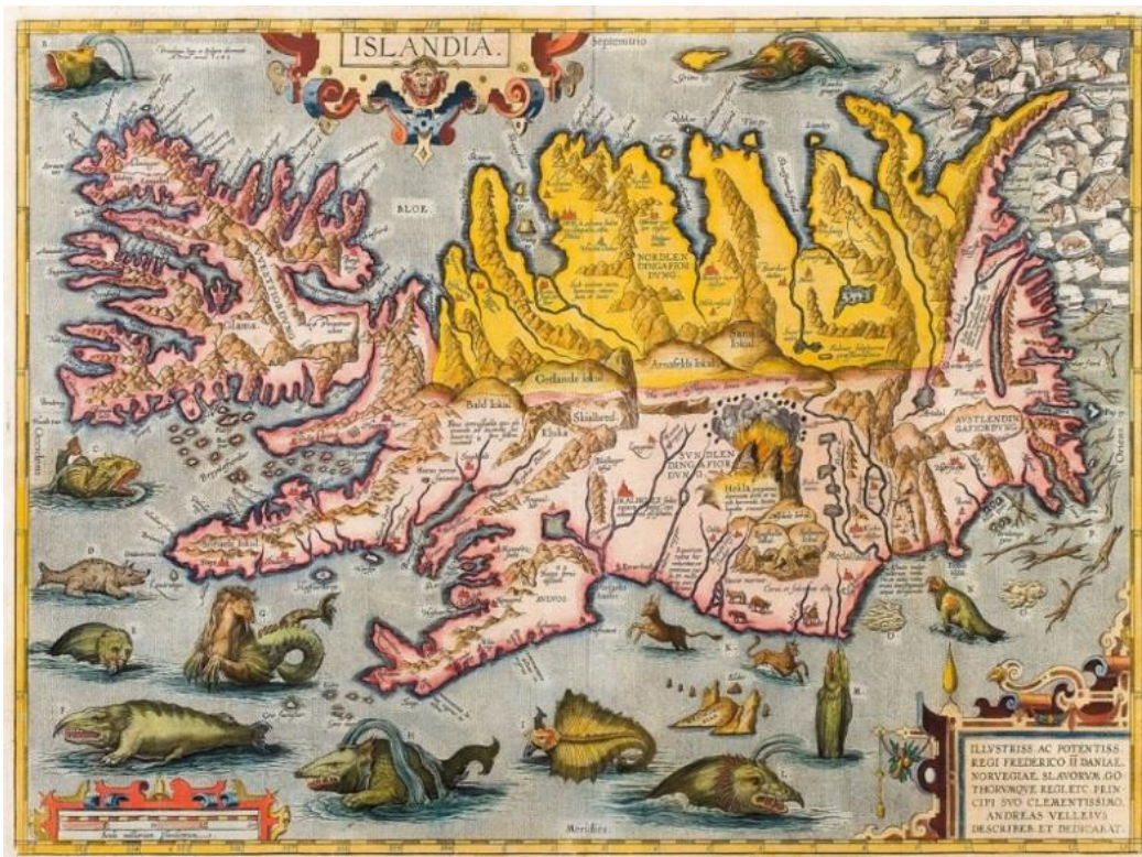
Abraham Ortelius's Iceland Map (1591)

A really important note about the Canvas reading materials in this course: You have one of two choices for accessing these readings in this course: You can 1) print out the articles in hard copy, or 2) download the articles and bring them to class on an electronic reading device. If you choose option number 2 there are caveats. First, the only electronic devices permissible for the readings are laptops or ipad-type readers. No cell phones! I am strict of this. Second, you must bring your device with you on the day that we discuss those readings. This is the price you pay for going electronic.